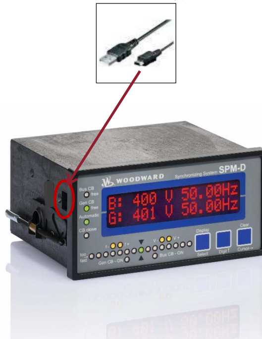
Mini USB cable Type B